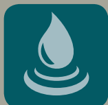
water we drink