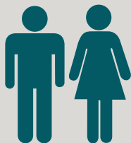
impact on human health