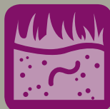
soil we live on