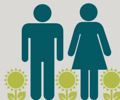
environmental public health