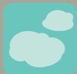
air we breathe