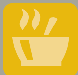
food we eat